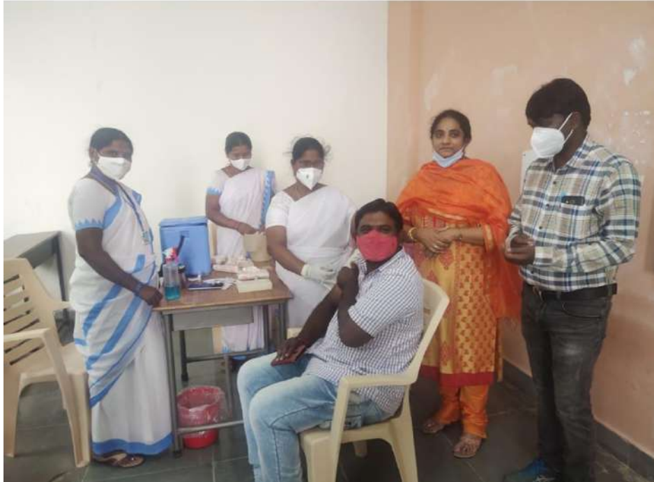
Vaccination camp by DMH on 8 th Nov., 2021