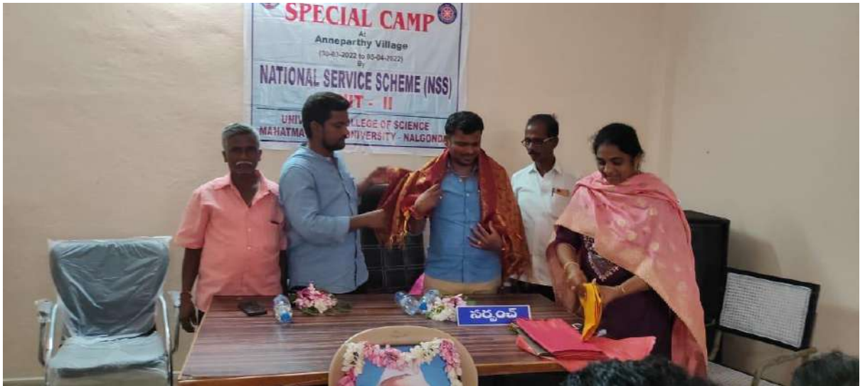
Valedictory session on 05-04-2022