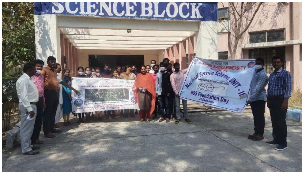
International Asian Water Bird Census Day on 12 th Feb.,2022