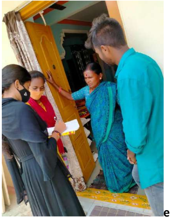
Survey in the village