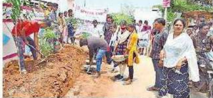
అన్నెపర్తిలో ఆశుదానం చేస్తున్న యువతరీయతకులు

వాన నీటిని ఒడిసి పట్టేందుకు ఇంచుమీ స్రావ్యత, మురుగుదొడ్ల నిర్మాణం వంటి అంశాలను ఎంచుకుని గ్రామీణ ప్రాంతాల్లో ప్రజలను చైతన్యం చేస్తున్నారు. గ్రామాల్లో ప్రజలు ఎదుర్కొంటున్న సమస్యలను సైతం పరిశీలించి ఆయా ప్రాంతాలకు చెందిన ప్రజాప్రతినిధులు, సంబంధిత అధికారుల దృష్టికి తీసుకుపోయి వాటిని పరిష్కరించే విధంగా బాటలు వేస్తు న్నారు. దీనికి చదువు తున్న కళాశాలలో ప్రత్యే కంగా ఏర్పాటు చేసిన జాతీయ సేవ సంస్థ(ఎన్ఎస్ఎస్) ద్వారానే సామాజిక స్పృహను మెల్లొల్లు తున్నారు.