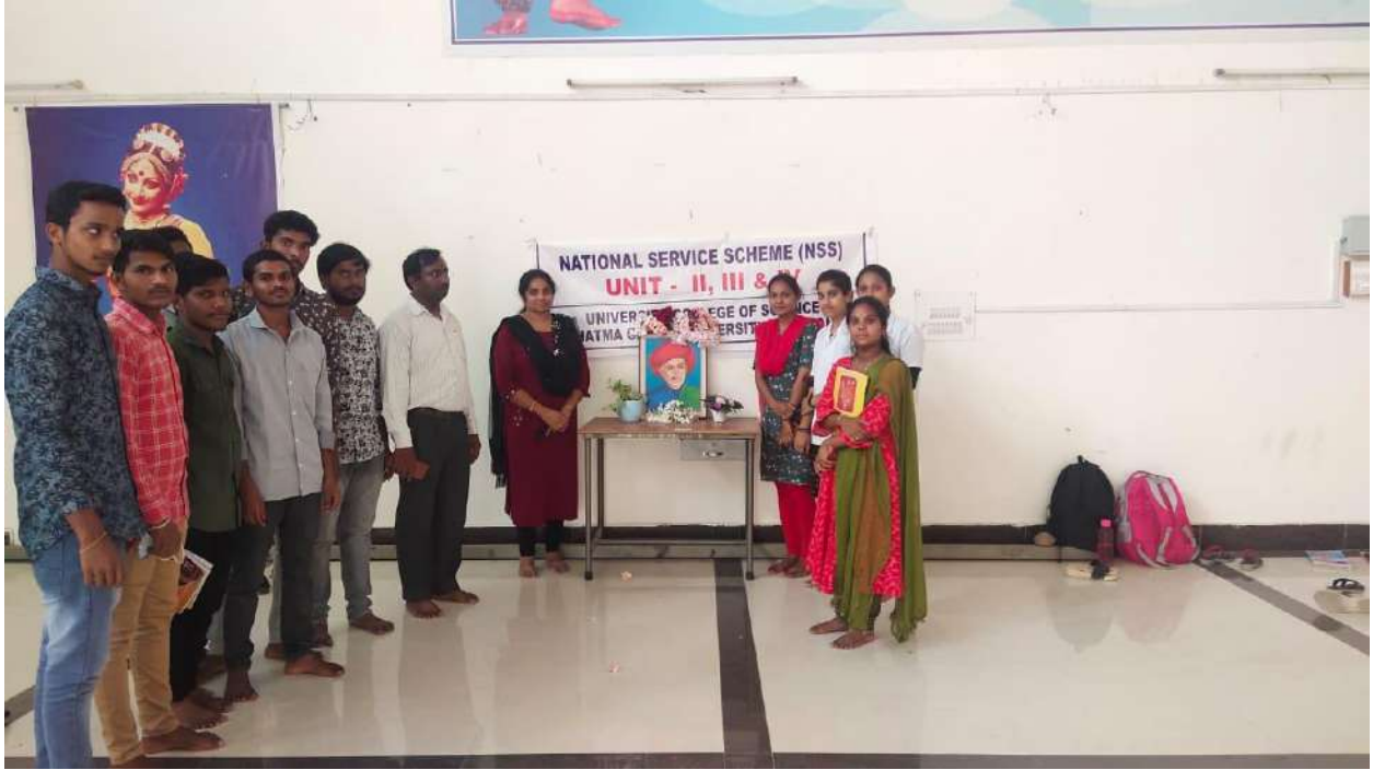
Jyothi Rav Phule Jayanthi on April 11 th , 2022