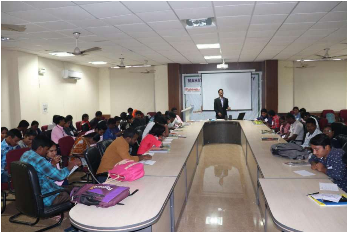
Trainer talking to the participants in the Session - Class Room Training Programme