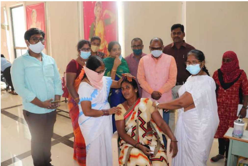
Vaccination drive on 25 th August, 2021