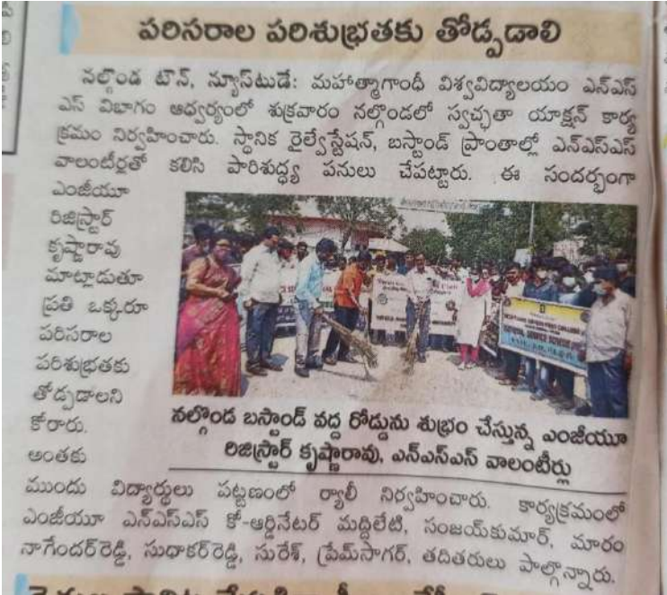
Swatchhatha Cleaning Day on 19 th Feb.,2022