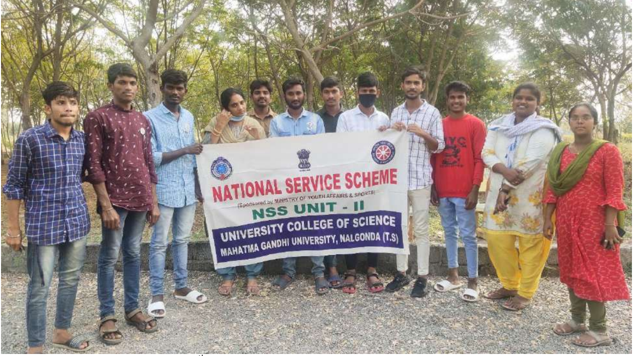
Swatchhatha Cleaning Day on 19 th Feb.,2022