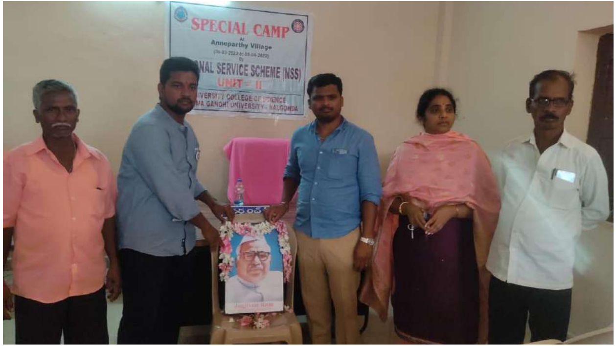
Dr. Babu Jagjeevan Rao Gari Jayanthi on April 5 th , 2022