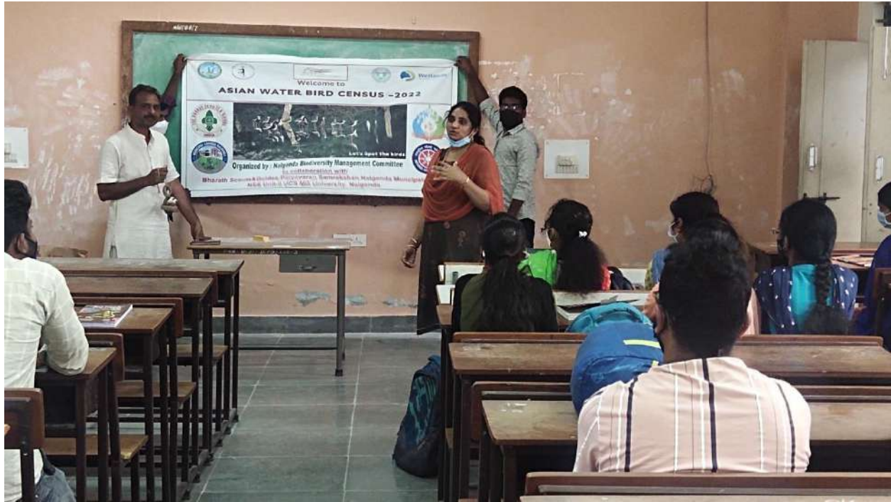
International Asian Water Bird Census Day on 12 th Feb.,2022