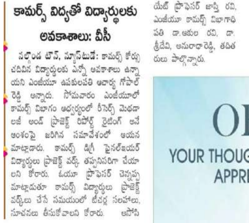
EENADU NEWS PAPER