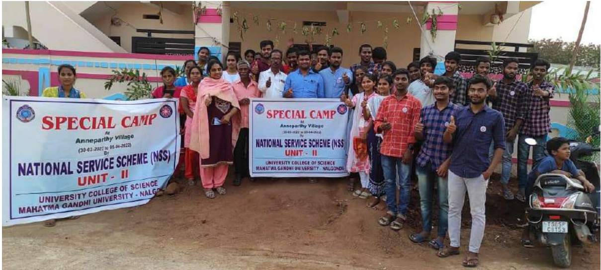
Valedictory session on 05-04-2022