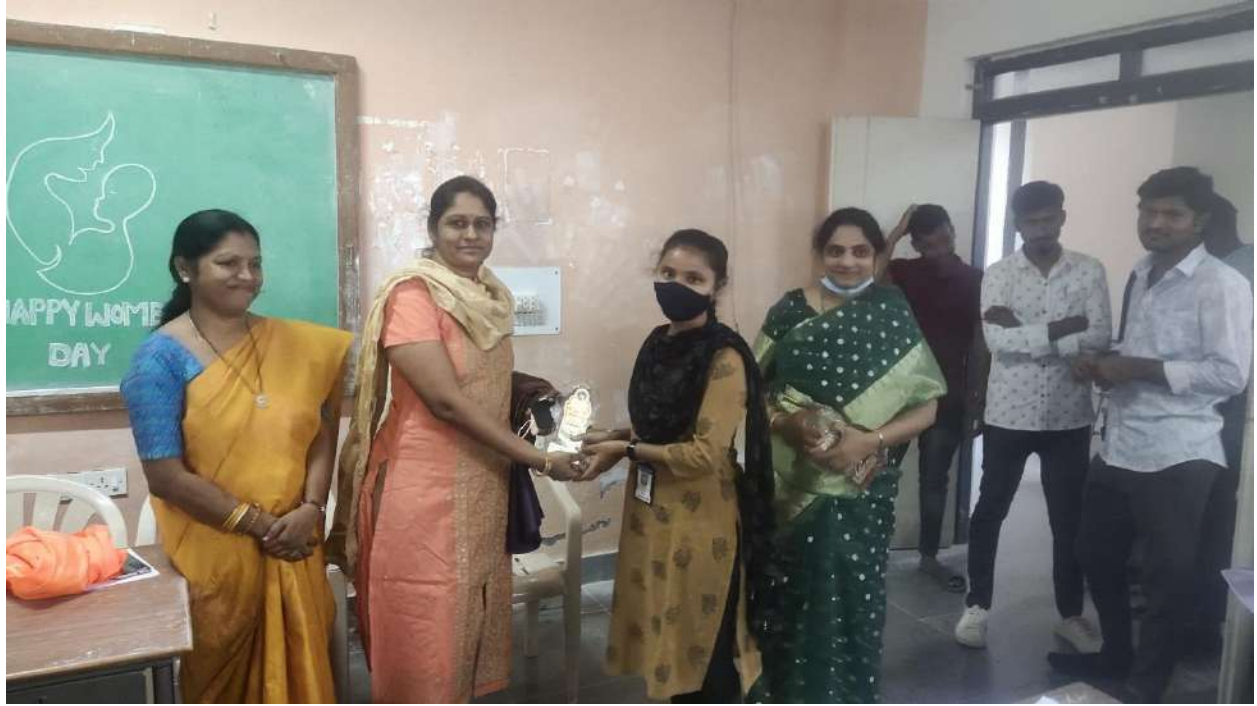
International Women's day on March 8 th 2022