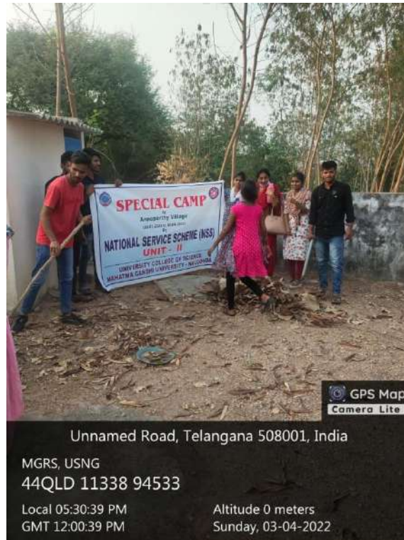
Clean & Green program at Old Grama Panchayathi office, Anneparthi