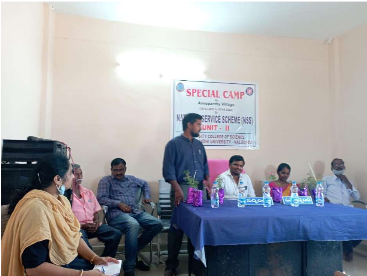
Inaugural session of Special camp