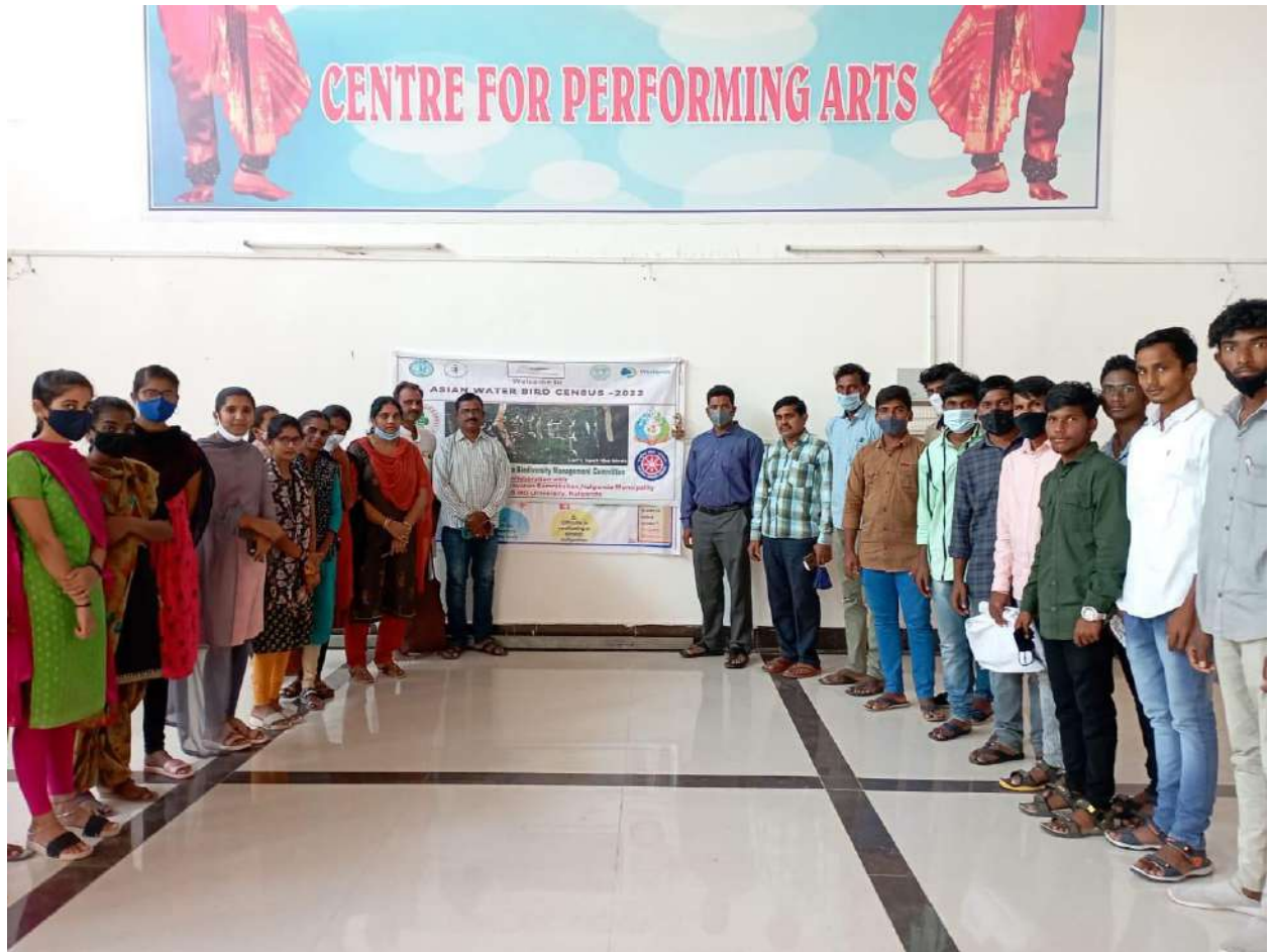
International Asian Water Bird Census Day on 12 th Feb.,2022