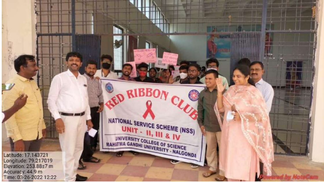
Red Ribbon Club (Aids) on March 26 th , 2022