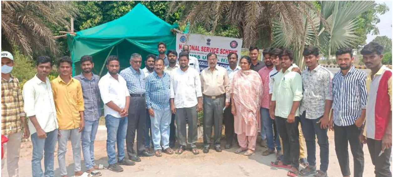
Opening of Chalivendram on April 7 th , 2022 (It will run till June 8 th )