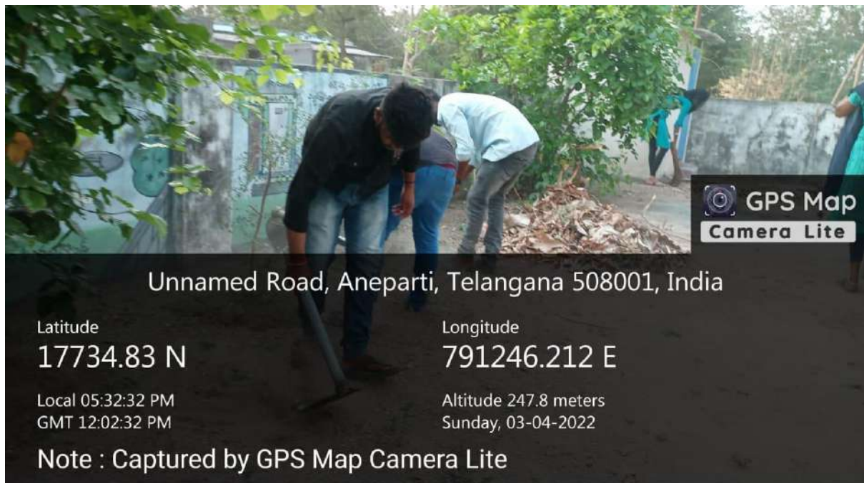
Clean & Green program at Old Grama Panchayathi office, Anneparthi