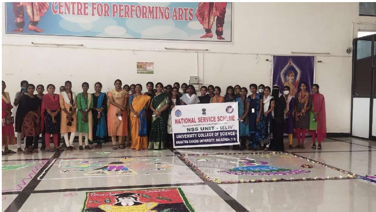
International Women's day on March 8 th 2022