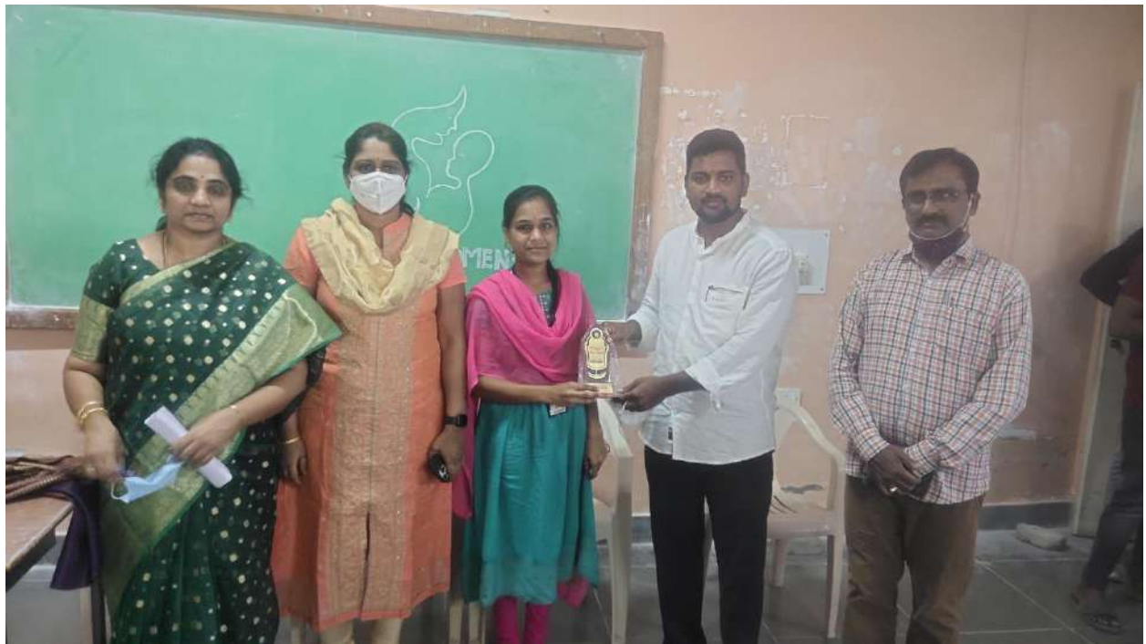
International Women's day on March 8 th 2022