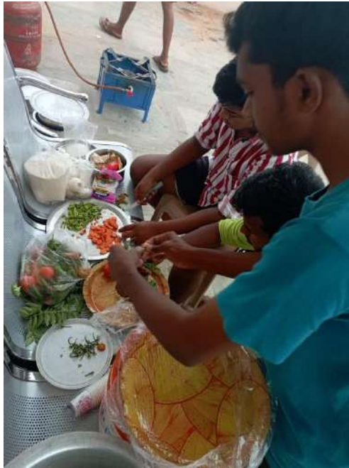
Cooking by NSS volunteers