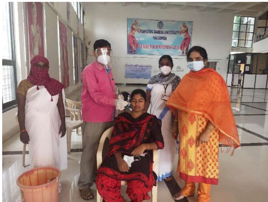
Vaccination camp by DMH on 8 th Nov., 2021