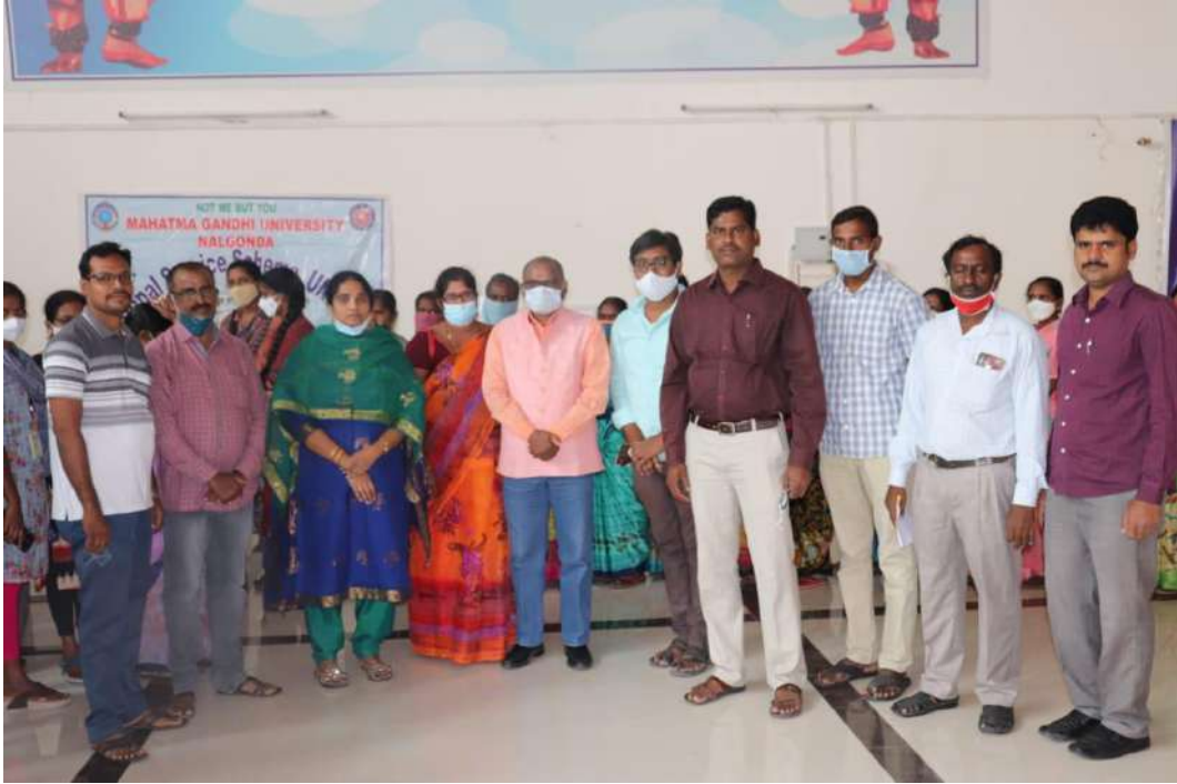
Vaccination drive on 25 th August, 2021