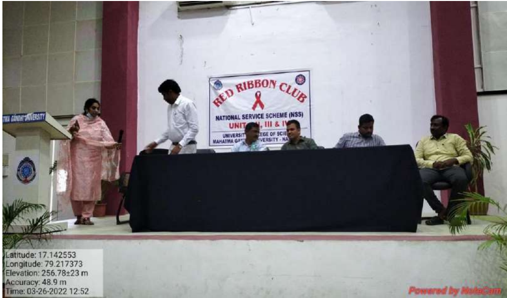
Red Ribbon Club (Aids) on March 26 th , 2022