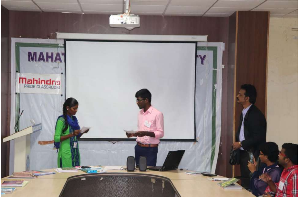
Students participating and exhibiting their skills in the Sessions