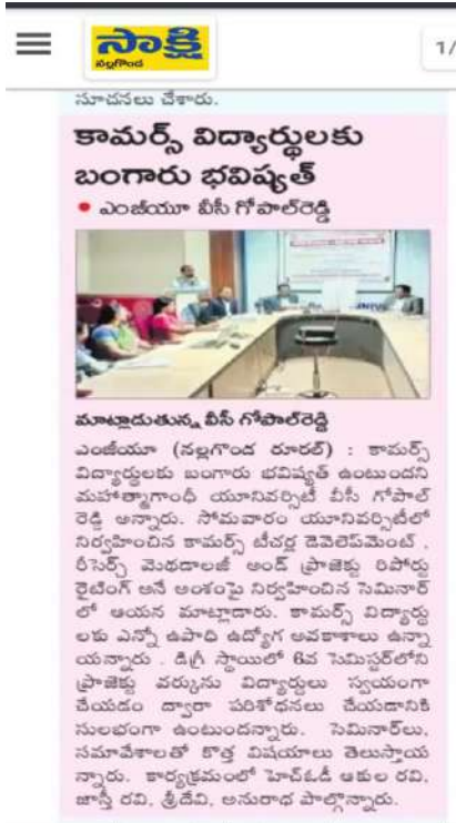
SAKSHI NEWS PAPER